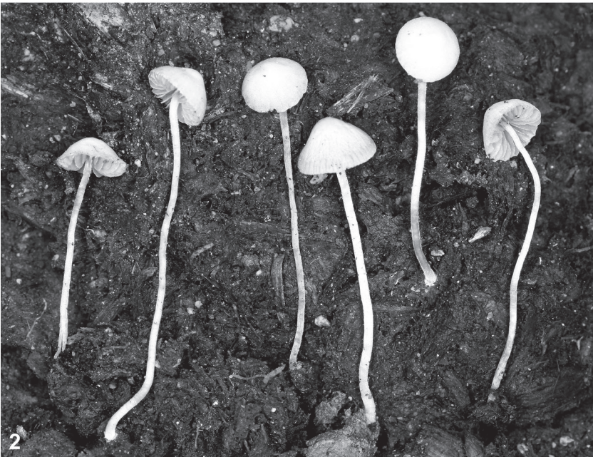
FIGS. 1–2. Basidiocarps in situ. 1. Conocybe caeruleobasis . 2. Pholiotina mairei var. stercorea .