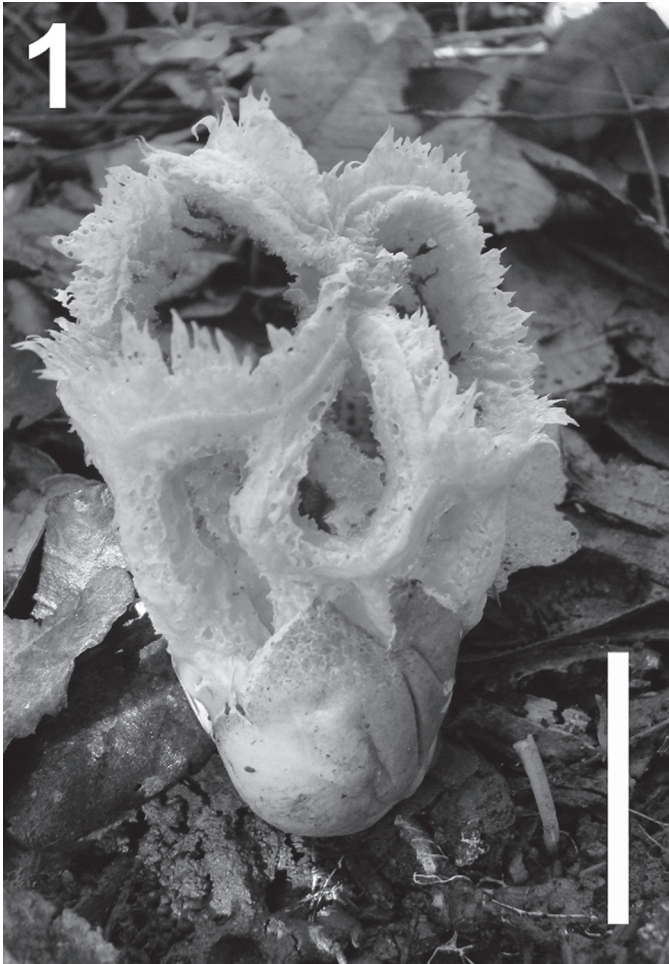
FIGURE 1. Clathrus cristatus . Basidiome in situ (scale bar = 2 cm).