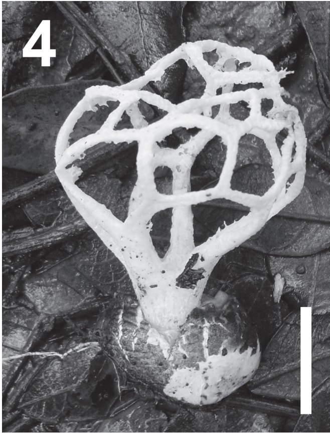
FIGURE 4. Clathrus chrysomycelinus . Basidiome in situ (scale bar = 2 cm).

similar. However, in Ileodictyon the receptacle arms are not fused to form a short stipe and the whole receptacle occasionally becomes detached from the volva. Moreover, Ileodictyon species have a gelatinous receptacle and simple tubular (circular in trans-section) arms without dorsiventral differentiation (Dring 1980, Miller & Miller 1988).