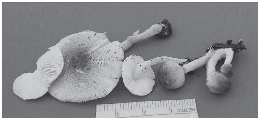
FIG. 1. Leucoagaricus dacrytus — Habitus (from Balsley, 12 July 2006).

umbo, when young almost completely dull brown (oac702) except for a marginal, lighter zone, later only brown at umbo, and very light at margin, covered in small fibrillose-cobwebby patches to tufts, dense at centre, thinner at margin and there showing off-white background, on drying slightly sulcate for up to 5 mm at margin, covered with scattered drops, changing from golden yellow (oac856) to brown with age. LAMELLAE, L = 45–55, l = 1(–3), moderately crowded to crowded (2–3/1 mm, measured at pileus margin), free, relatively close to stipe, off-white to pale cream coloured, with concolourous not obviously cystidiose edge. STIPE 20–50 × 1.5–3.5 mm cylindrical and slightly wider, 3–5 mm, at utmost base, off-white above annulus, below annulus off-white changing to pale yellow with age, slightly darker when scratched, when fresh covered in pale yellow to yellow (oac856) drops, sometimes with basal white tomentum, hollow, with white mycelial cords at base. ANNULUS an ascending funnel with small flaring part, off white, with golden drops on underside. SMELL none.