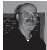
Vice-Chair (& photographer) Redhead post-session