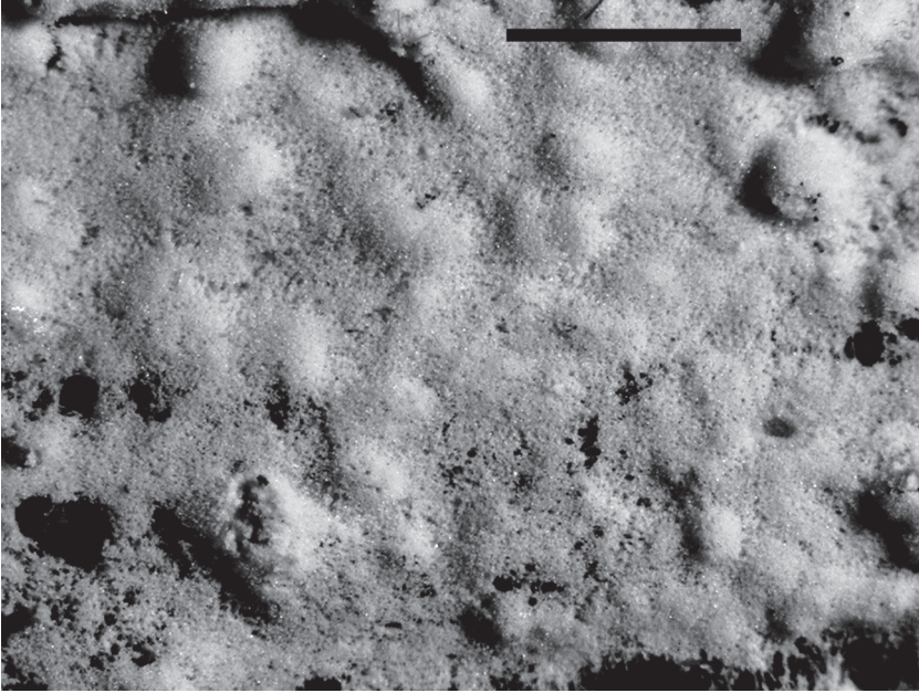
FIG. 3. Verruculose basidiome surface of Hyphoderma cremeoalbum (KHL4100). Bar = 1 mm.

\mu\text{m} , Q = 2^* - 2.1 , often containing oil-like globules, occasionally germinating, walls thin, hyaline, smooth, acyanophilous, not reacting in Melzer's reagent.