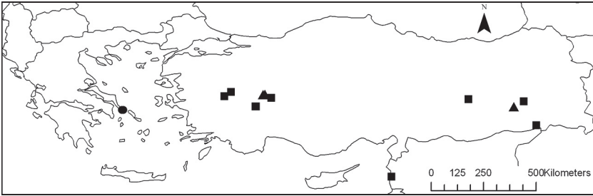
FIGURE 2. Distribution of Aspiciella albosparsa (■) and Protoparmeliopsis klauskalbii (▲ = Specimens examined, ● = Locality cited in Sipman 2007)

brown discs; lecanoric acid present (in Turkish specimens) (C+ orange to reddish), usnic and norstictic acids absent (K-, KC-).