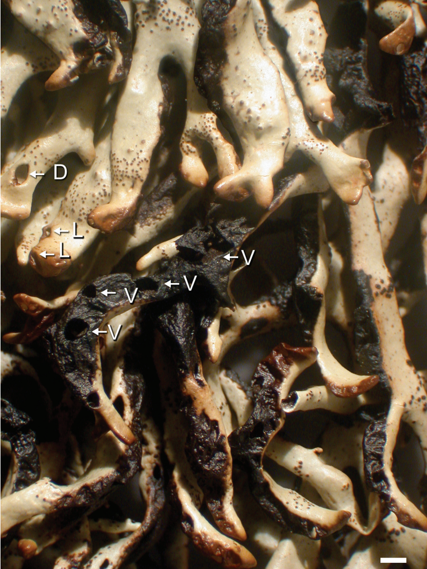
FIG. 1. Hypogymnia irregularis habit and perforations. Arrows indicate examples of dorsal (D), lateral (L), and ventral (V) perforations (McCune 25576, holotype). Dorsal perforations are infrequent, lateral perforations occasional, and ventral perforations common. Scale bar 1 mm.

(especially Rhododendron , Quercus , Sorbus , and dwarf bamboo).