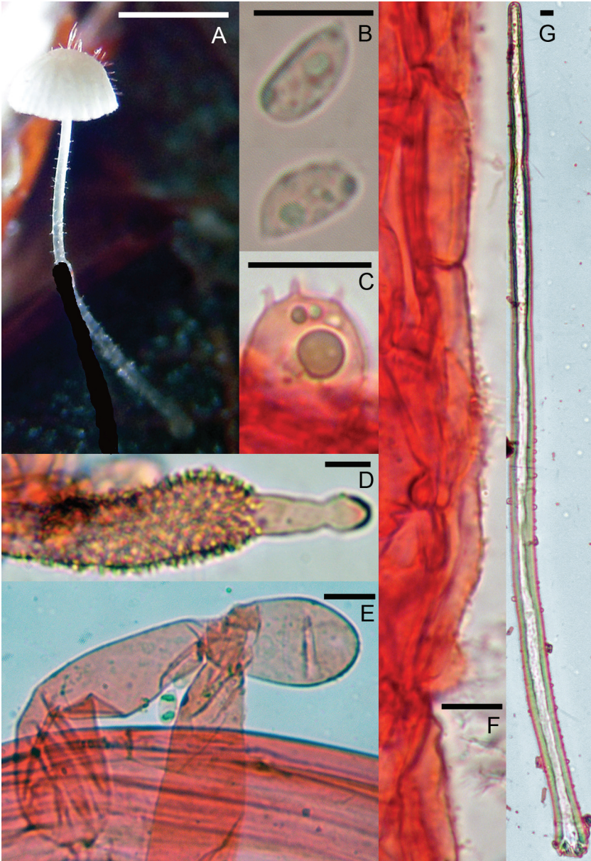
PLATE 1: Mycena saloma . A, basidioma (holotype); B, basidiospores (DM486); C, basidium (DM486); D, pileus marginal cystidium (DM486); E, caulocystidium (DM486); F, pileipellis (DM486); G, pileus hair (DM486). (Scale bars: A = 5 mm; B–G = 10 \mu m.)