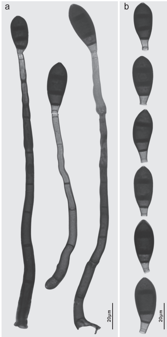
FIG. 1. Endophragmiella clausenae . a. Conidiophores and conidia. b. Conidia.