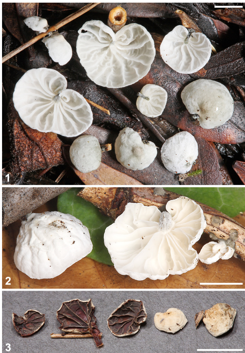
Figs 1–3. Marasmiellus milicae . 1. Fresh basidiomata (holotype). 2. Fresh basidiomata (CNF 1/5774). 3. Dried basidiomata (holotype). Bars = 5 mm.