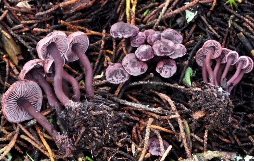
FIG 1. Pseudobaeospora deckeri . Basidiocarps. NS 14Jan2010.