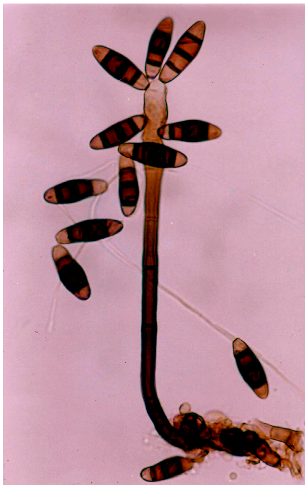
FIG. 4. Pleurophragmium indicum . Conidiophores and conidia, 600 \times .

base, smooth, 4–6-septate, dark brown below, pale brown in the middle and above, thick-walled, 100–160 \mu\text{m} long, 7–22 \mu\text{m} wide at base, 4.5–6.5 \mu\text{m} wide in the middle and near apex. CONIDIOGENOUS CELLS polyblastic, integrated, terminal, cylindrical, sympodial, minutely denticulate, noncicatrized, smooth, pale brown to subhyaline, 15–23 \times 4.5–9.5 \mu\text{m} . CONIDIA solitary, simple, dry, ellipsoidal to obovoid, rounded at the apex, narrower at the base, straight to slightly curved, smooth, transversely 3-septate, middle cells dark brown, end cells pale brown, 20–30 \times 4.5–11 \mu\text{m} , 3–5 \mu\text{m} wide at the ends.