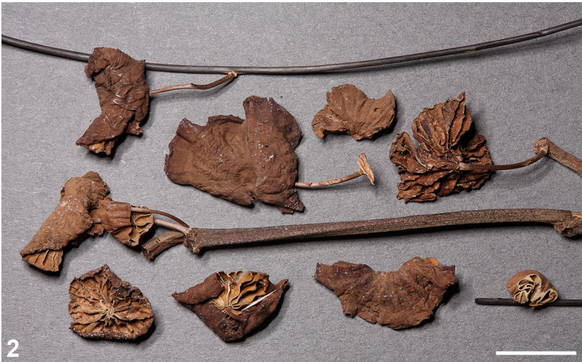
PLATES 1-2. Dried basidiomata (holotypes).

1. Marasmius nigroimplicatus . 2. Marasmius subrigidichorda . Bars: 1 = 5 mm; 2 = 10 mm.