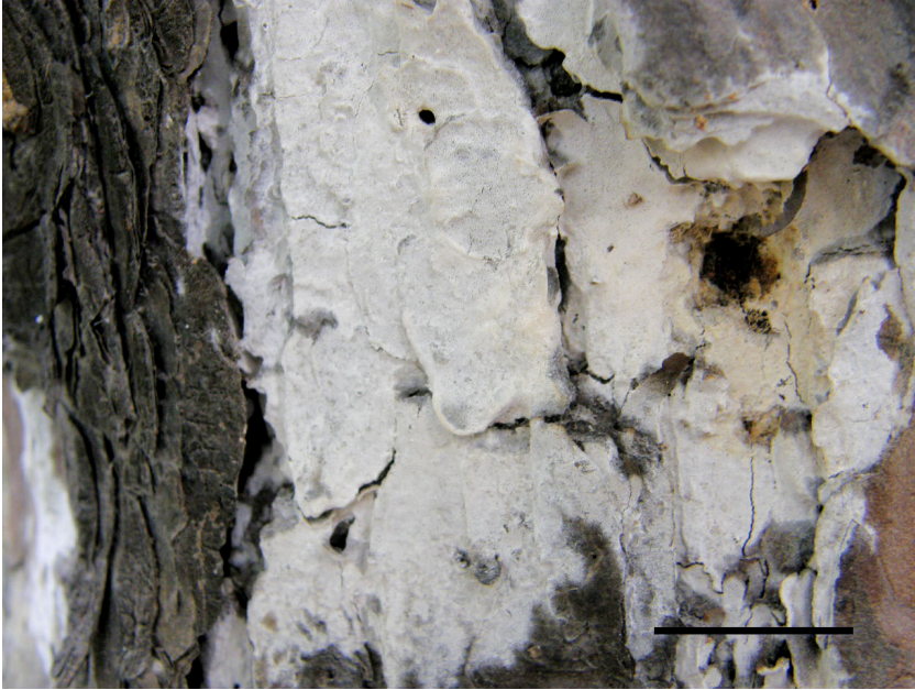
FIG. 1. Hypochnicium pini (NIBRFG0000107453, holotype). Basidiocarp. Scale bar = 1 cm.

within the hymenium or projecting up to 40 \mu\text{m} above the basidial layer, thin-walled, variable in size, 40–80 \times 5.5–8.5 \mu\text{m} . Basidia clavate, sinuous, 28–39 \times 5.5–7.5 \mu\text{m} , with four sterigmata and a basal clamp. Basidiospores broadly ellipsoid to subglobose, 5.5–6.9 \times 4.6–5.9 \mu\text{m} , mean 6.1 \times 5.2 \mu\text{m} , verrucose in 1% cotton blue and 1% phloxine, smooth in 5% KOH, thick-walled, some with a few guttula, spore wall cyanophilous, IKI–.