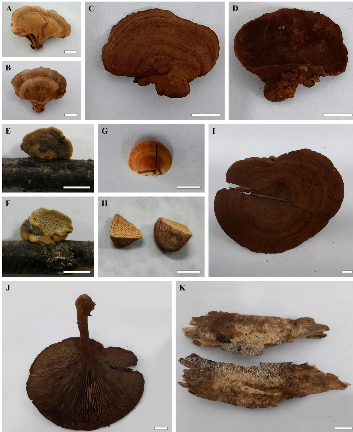
FIG. 2. Species recorded for the first time from the Cerrado Biome. A–B. Flabellophora parva . C–D. Hymenochaete microcycla . E–F. Navisporus sulcatus . G–H. Truncospora ohiensis . I–J. Stiptophyllum erubescens . K. Trechispora mellina . Scale bars = 1 cm.

We analyzed 192 samples that resulted in the identification of 51 species, six of which are new records from the Cerrado (FIG. 2), five from the Midwest region, and two for the State of Goiás. Considering the distribution in Brazil of the new occurrences for Cerrado, Navisporus sulcatus and Trechispora mellina were only known for the Atlantic Forest, Flabellophora parva for Atlantic Forest and Caatinga, while Hymenochaete microcycla , Stiptophyllum erubescens , and Truncospora ohiensis have a distribution known, so far, for the Amazonia and Atlantic Forest biomes.