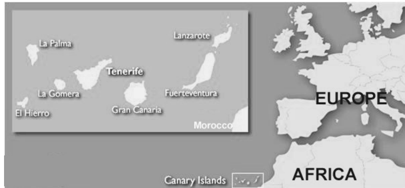
Map 1. The Canary Islands geographical location.

HIERRO: (H-1) Valverde, near to Timijiraque, 27°46'7"N 17°54'43"W, 50 m, very degraded Euphorbia lamarckii community (c); (H-2) Ibidem, near to the Roques de la Bonanza, 27°44'29"N 17°55'53"W, 100 m, (c); (H-3) Frontera, Punta de la Dehesa, near to Verodal beach, 27°45'13"N 18°8'57"W, 50 m, (c); (H-4) Ibidem, above Punta de la Dehesa, 27°45'12"N 18°8'39"W, 250 m, (c); (H-5) Ibidem, 27°44'42"N 18°8'31"W, 350 m, (c); (H-6) Ibidem, Punta de la Dehesa, 27°45'59"N 18°7'45"W, 35 m, (c); (H-7) Ibidem, El Golfo, Las Puntas, 27°47'6"N 17°59'37"W, 75 m, (d); (H-8) Ibidem, near to La Restinga, 27°38'26"N 17°59'59"W, 75 m, (c); (H-9) Valverde, Tamaduste, 27°48'51"N 17°53'34"W, 50 m, (a); (H-10) Ibidem, La Caleta, 27°48'19"N 17°53'33"W, 50 m, (a); (H-11) Ibidem, Echedo, near to the Montaña de las Salinas, 27°50'26"N 17°55'26"W, 80 m, (b); (H-12) Idem, near to Mocanal, 27°49'21"N 17°55'25"W, 550 m, (d). LA PALMA: (P-1) Mazo, Montaña del Azufre, 28°33'23"N 17°46'12"W, 190 m, anthropic Euphorbia lamarckii community (c); (P-2) Puntallana, on the way to Martín Luis, 28°43'10"N 17°44'36"W, 150 m, (b); (P-3) Garafía, Santo Domingo, 28°48'51"N 17°57'40"W, 190 m, (a).