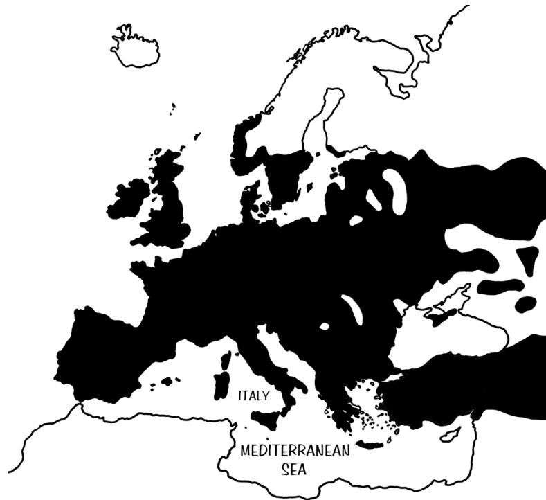
Figure 1. Map of approximate distribution of Quercus in Europe (AFE 2007)

Monte Genuardo and Santa Maria del Bosco, (57b) Sicilia, Palermo, Monte Pellegrino, (57c) Sicilia, Palermo, R.N.O. Serre della Pizzuta, (57d) Sicilia, Palermo, Villa Malfitano; (58) Sicilia, Palermo, Monte Carcaci, (58a) Sicilia, Palermo, Bosco della Ficuzza, (58b) Sicilia, Palermo, Monte San Calogero, (58c) Sicilia, Palermo, Monte Rose; (58d) Sicilia, Palermo, Serre di Ciminna; (59) Sicilia, Palermo, Pizzo Cane, (59a) Sicilia, Palermo, Valle di Rebottone, (59b) Sicilia, Palermo, R. N. O. of Palazzo Adriano, (59c) Sicilia, Palermo, Portella Rena; (60) Sicilia, Agrigento, Monte Cammarata, (60a) Sicilia, Agrigento, Serra Quisquina, (60b) Sicilia, Agrigento, Eremo della Quisquina; (61) Sicilia, Trapani, Bosco Inici; (62) Sicilia, Messina, Mugolino, (62a) Sicilia, Messina, St. Domenica Vittoria, (62b) Sicilia, Messina, Furiano, (62c) Sicilia, Messina, Parco dei Nebrodi; (63) Sicilia, Siracusa, Bosco Bauli; (64) Sicilia, Catania, Parco dell'Etna.