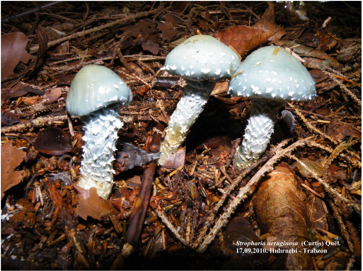
Stropharia aeruginosa (Curtis) Quél. 17.09.2010. Hidirnebi - Trabzon