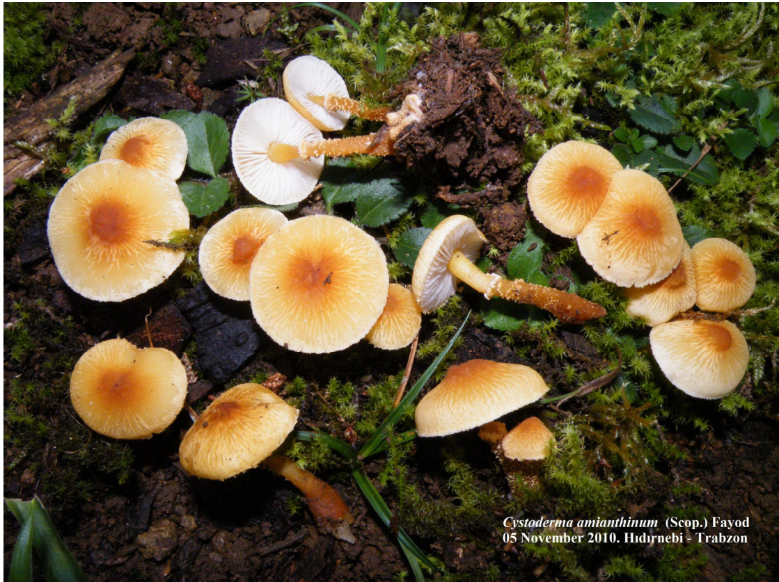
Cystoderma amianthinum (Scop.) Fayod 05 November 2010. Hidirnebi - Trabzon

2 Royal Botanic Garden Edinburgh, 20A Inverleith Row, Edinburgh, EH3 5LR Scotland – UK