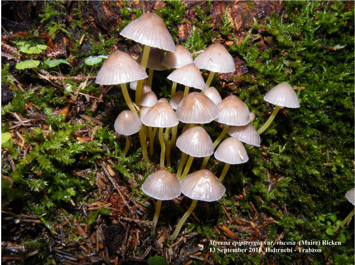
Mycena epipterygia var. viscosa (Maire) Ricken 13 September 2010, Hidirnebi - Trabzon